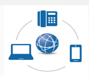
Unified Communications & Collaborations